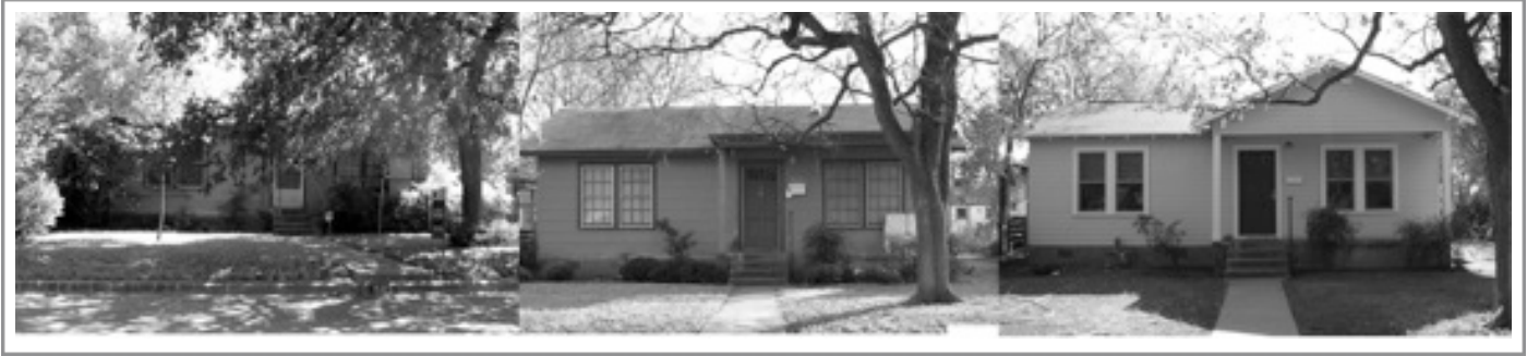
The transformation of the Borowicz residence: before, during and after

Over the past few years, our area has enjoyed a number of slow and steady improvements. Young urban professionals who love our central location are moving here in droves. Parents pushing strollers down the street has become a common sight. Sleek new shops and office buildings have replaced tired old ones. And it seems like just about everyone is fixing up their houses with a fresh coat of paint here, a bathroom remodel there, or even entirely new construction.