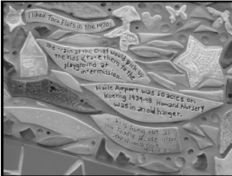
Scenes from the Crestview mosaic memory wall at the shopping center at 7101 Woodrow Avenue feature memories of a life gone by in this part of Austin.

"Hello and welcome" indeed. Welcome to the memories of old Austin.